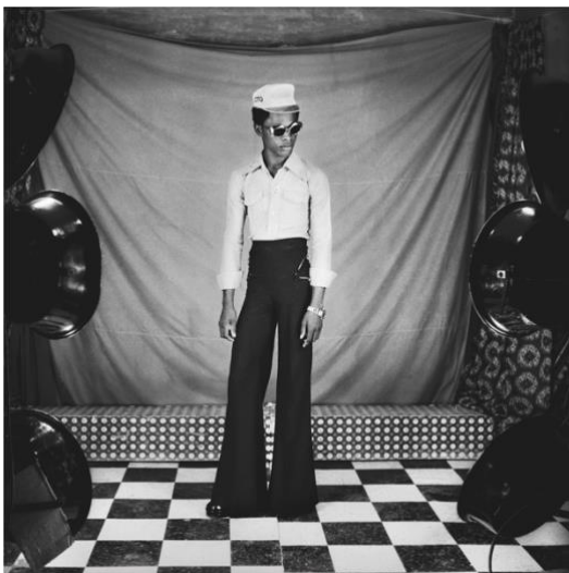
Image 3 Samuel Fosso Autoportrait, from the Series 70's Lifestyle, 1976 © Samuel Fosso Courtesy of the artist and JM Patras, Paris