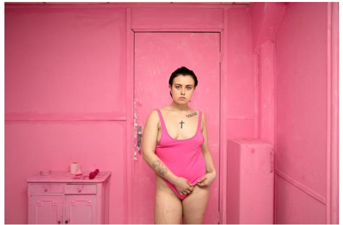
Image 2 Bieke Depoorter Agata Paris, France, November 2, 2017 © Bieke Depoorter/ Magnum Photos (in collaboration with Agata Kay) Courtesy of the artist