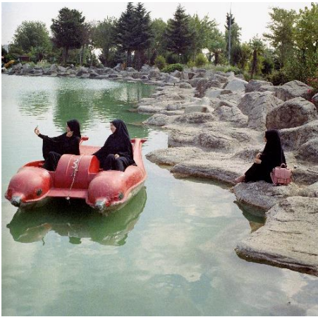
Image 5 Sabiha Çimen, Untitled, from the series “Hafiz”, 2021

10 October 2024 to 9 March 2025, The Cube, Eschborn