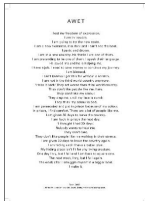
Image 11 Aida Silvestri, Awet, from the series “Even this will pass”, 2013