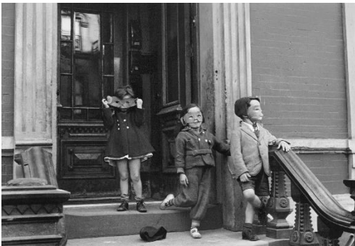
Image 15 Helen Levitt, N.Y., ca. 1940