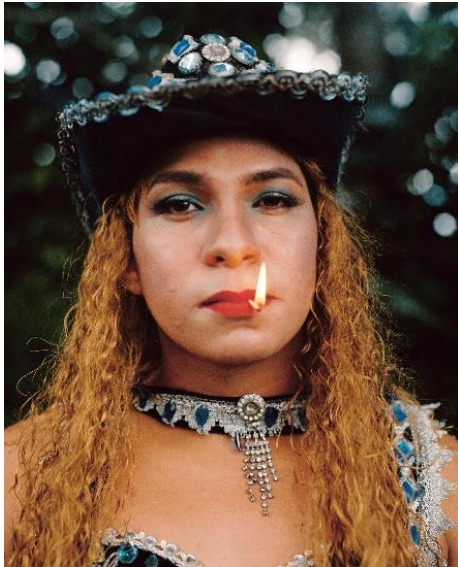
Image 1 Daniel Jack Lyons, Wendell in Drag, from the series “Like a River”, 2019

10 October 2024 to 9 March 2025, The Cube, Eschborn