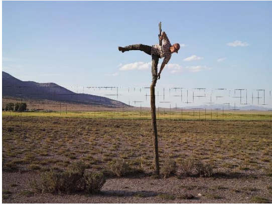
Image 9 Lucas Foglia, Tommy trying to shoot coyotes, Big Springs Ranch, Oasis, Nevada, from the series “Frontcountry”, 2012

10 October 2024 to 9 March 2025, The Cube, Eschborn