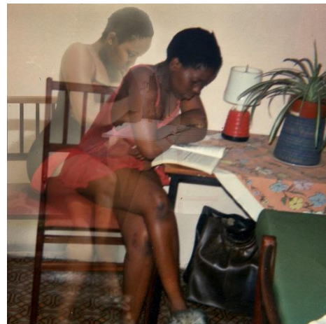
Image 4 Lebohang Kganye, Ke bala buka ke apere naeterese II, from the series “Ke Lefa Laka: Her-Story, 2013