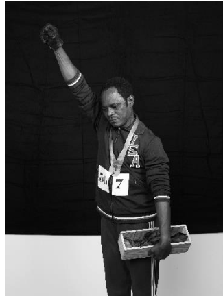
Image 10 Samuel Fosso, Tommie Smith, from the series “African Spirit”, 2008 © Samuel Fosso