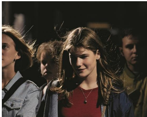
Image 12 Philip-Lorca diCorcia, Head #23, from the series „Head“, 2000 © Philip-Lorca diCorcia