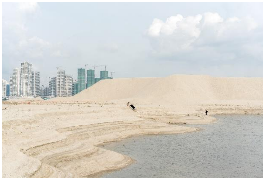
Image 3 Chi Yin Sim, Shifting Sands #1, Malaysia, 2017