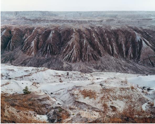
Image 13 Inge Rambow, Bei Finsterwalde, Brandenburg, from the series “Wüstungen”, 1992

10 October 2024 to 9 March 2025, The Cube, Eschborn