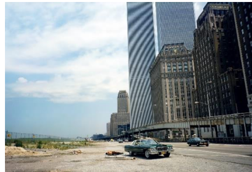
Image 16 Mitch Epstein, West Side Highway, New York City, from the series „Recreation“, 1977