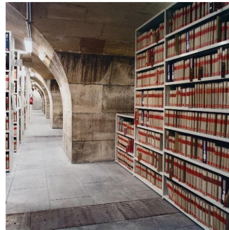
Image 8 Candida Höfer, Bibliothèque Nationale de France Paris XVI, 1998