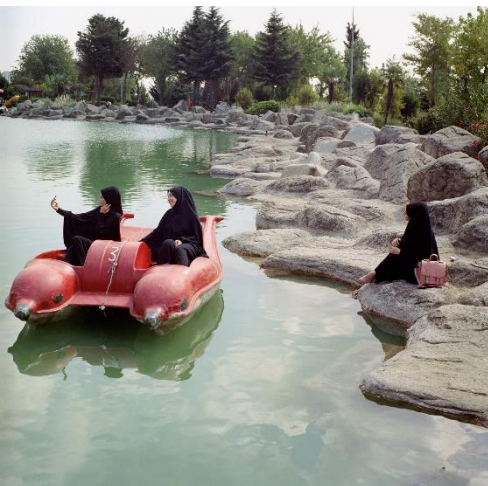
Image 7 Sabiha Çimen, Hafiz 064, from the series “Hafiz” 2021