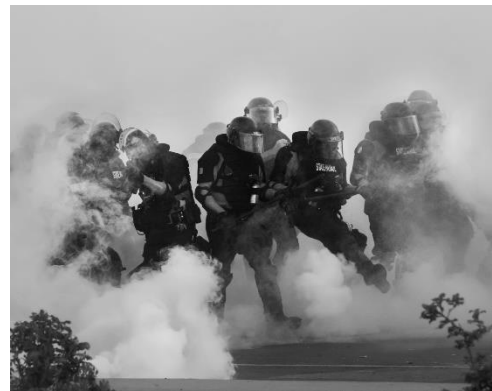
Image 8 Philip Montgomery, State Police, George Floyd Protests, Minnesota, May 2020