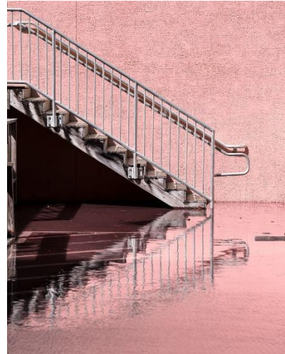
Image 6 Anastasia Samoylova, Staircase at King Tide, from the series “Floodzone”, 2019