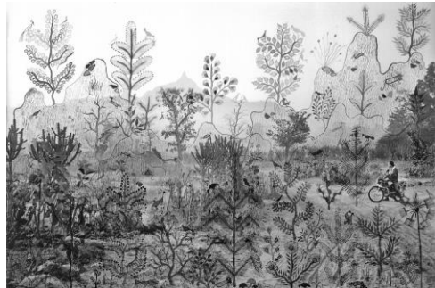
Image 4 Gauri Gill and Rajesh Vangad, Mountains and Trees, 2014, from the series “Fields of Sight”, 2013-ongoing. © Gauri Gill and Rajesh Vangad