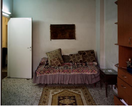
Image 7 Hrair Sarkissian, from the series “Last Seen”, 2018 – 2021 © Hrair Sarkissian