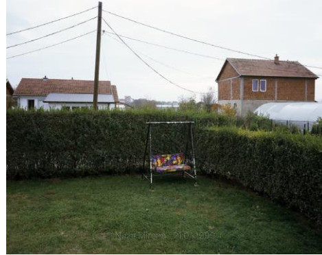
Image 8 Hrair Sarkissian, from the series “Last Seen”, 2018 – 2021 © Hrair Sarkissian