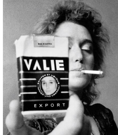
Image 2 VALIE EXPORT, SMART EXPORT Self- Portrait © VALIE EXPORT. Photo: Gertraud Wolfschwenger