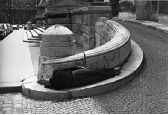
Image 1 VALIE EXPORT, from the series “Körperkonfigurationen” (Body Configurations), 1972-1976