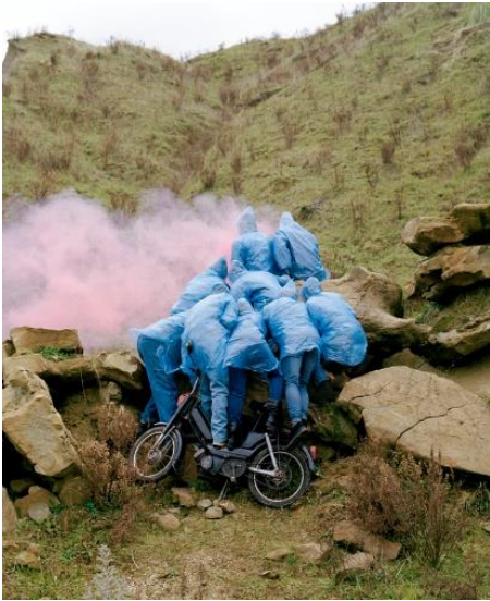
Image 5 Olgaç Bozalp, from the series "Home: Leaving One for Another"