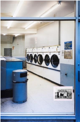
Image 5 Jana Bissdorf, untitled, from the series “Wege zum Glück“, 2018