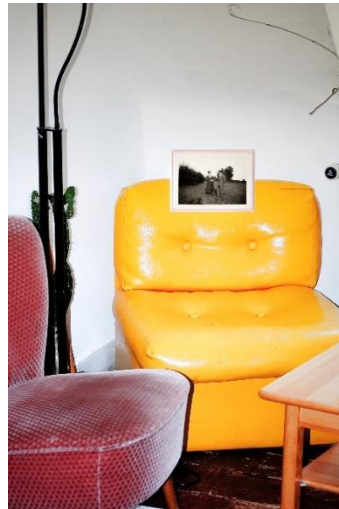
Image 6 Jana Bissdorf, untitled, from the series “Wege zum Glück“, 2018