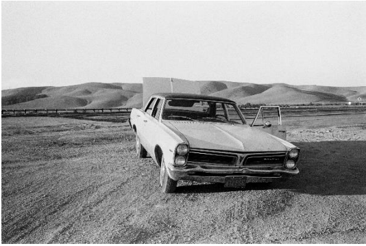
Image 13 Mimi Plumb, Highway 4, from the series “The White Sky”, 1975

Press images for the exhibition “RAY Echoes. Memory” 30 May to 22 September 2024, The Cube, Eschborn