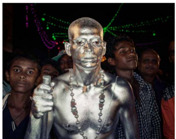
Image 4 Poulomi Basu From Centralia , 2020 © Poulomi Basu Courtesy of the artist