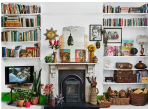
Image 13 Zineb Sedira Way of Life , 2019 Exhibition: A Brief Moment , Jeu de Paume, Paris, France © Zineb Sedira Courtesy of the artist and Kamel Mennour, Paris NB. The installation will be recreated at The Photographers' Gallery for the exhibition