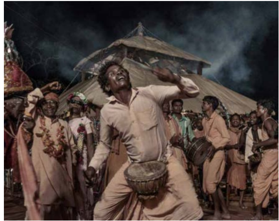
Image 2 Poulomi Basu From Centralia , 2020 © Poulomi Basu Courtesy of the artist