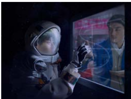
Image 11 Cao Fei Nova , 2019 © Cao Fei Courtesy of artist, Vitamin Creative Space and Sprüth Magers