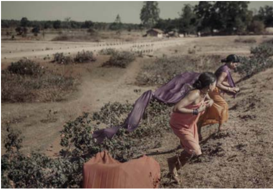
Image 1 Poulomi Basu From Centralia , 2020

DEUTSCHE BÖRSE PHOTOGRAPHY FOUNDATION PRIZE 2021