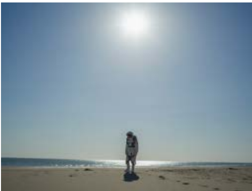
Image 9 Cao Fei Nova , 2019 © Cao Fei Courtesy of artist, Vitamin Creative Space and Sprüth Magers