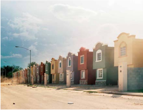
Image 5 Alejandro Cartagena Apodaca from A Small Guide to Homeownership , 2020