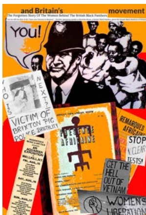
Image 15 For a Brief Moment the World was on Fire , 2019 Exhibition: A Brief Moment , Jeu de Paume, Paris, France © Zineb Sedira Courtesy of the artist and Kamel Mennour, Paris