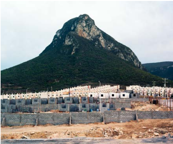
Image 7 Alejandro Cartagena Escobedo from A Small Guide to Homeownership , 2020 © Alejandro Cartagena Courtesy of the artist