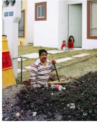
Image 6 Alejandro Cartagena Man digging a hole from A Small Guide to Homeownership , 2020