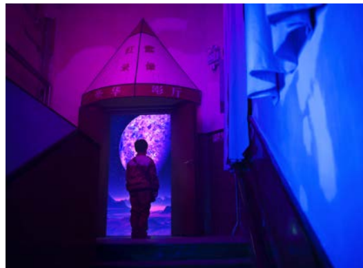
Image 10 Cao Fei Nova , 2019 © Cao Fei Courtesy of artist, Vitamin Creative Space and Sprüth Magers