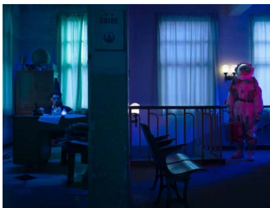
Image 12 Cao Fei Nova , 2019 © Cao Fei Courtesy of artist, Vitamin Creative Space and Sprüth Magers