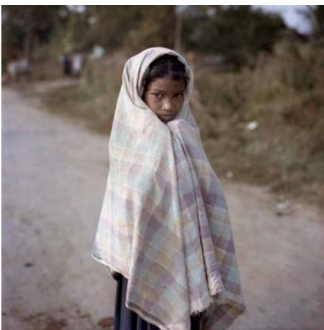
Image 3 Poulomi Basu From Centralia , 2020