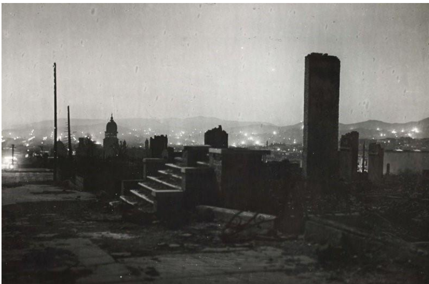
Image 5 Arnold Genthe, Stairs that lead to nowhere (after the fire), 1906. (1943.407.4.2) Achenbach Foundation, James D. Phelan Bequest Fund, Fine Arts Museums of San Francisco