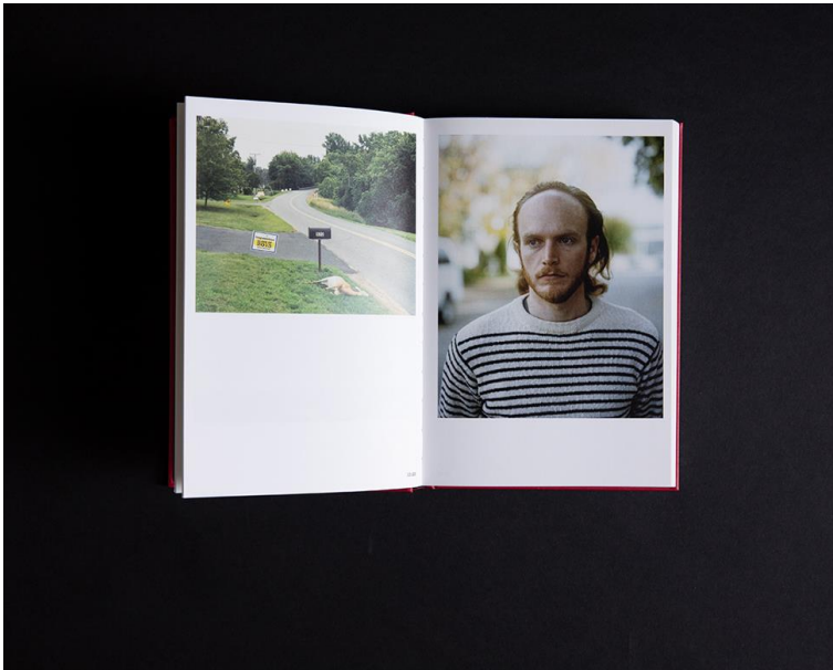
Image 6 Spread from “One Wall a Web” by Stanley Wolukau-Wanambwe, published by ROMA publications (2018)

Images 6-10 from „Writing Photography“, awarded to Stefan Vanthuynne