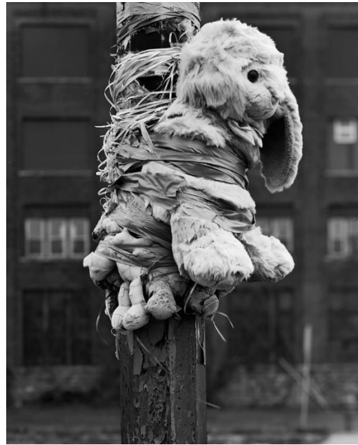
Image 9 Paderewski Drive, 2015 (All my Gone Life, Vol.2) - "One Wall a Web" by Stanley Wolukau-Wanambwe, published by ROMA publications (2018)