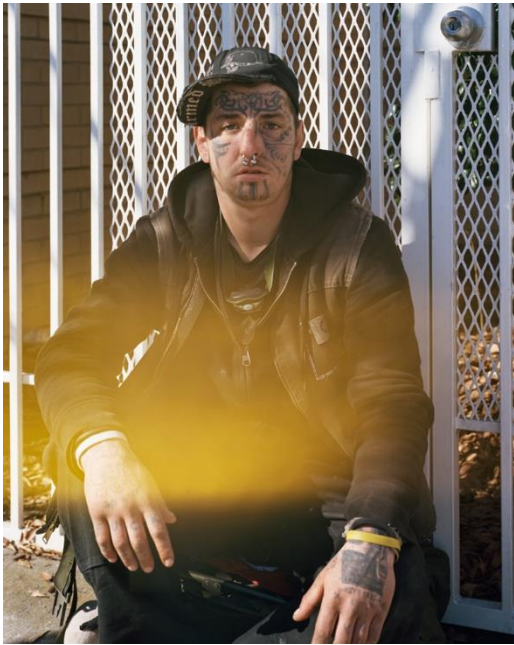
Image 8 Hancock St, 2014 (Our present Invention) - "One Wall a Web" by Stanley Wolukau-Wanambwe, published by ROMA publications (2018)