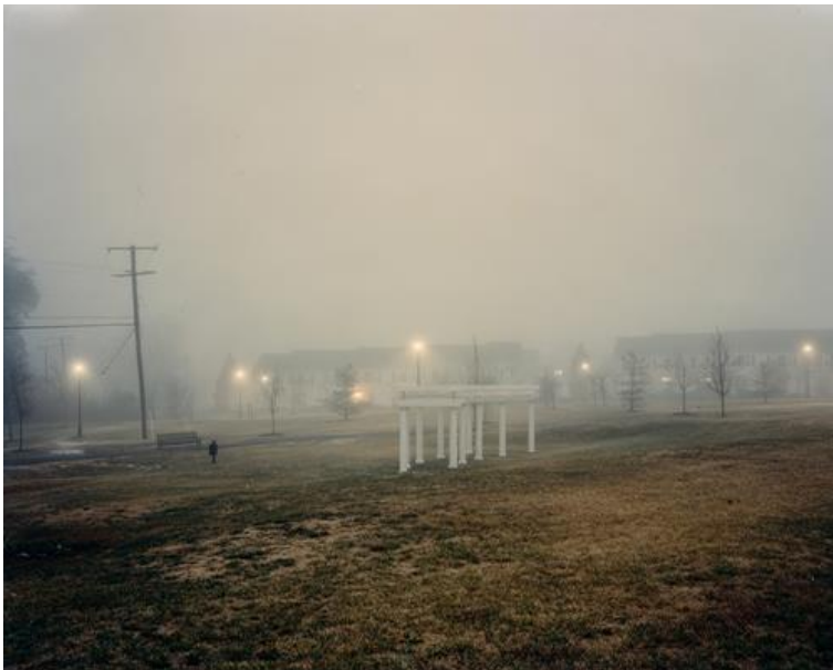
Image 7 The Estates at Horsepen, 2014 (Our present Invention) - “One Wall a Web” by Stanley Wolukau-Wanambwe, published by ROMA publications (2018)