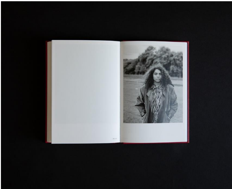
Image 10 Spread from "One Wall a Web" by Stanley Wolukau-Wanambwe, published by ROMA publications (2018)