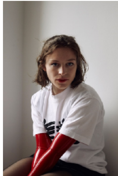
Image 6 Max Eicke, To strike a pose is to pose a threat, 2021