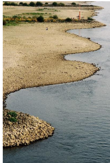
Image 4 Caroline Brünen, It Is the Water Flowing that Makes the Sound © Caroline Brünen