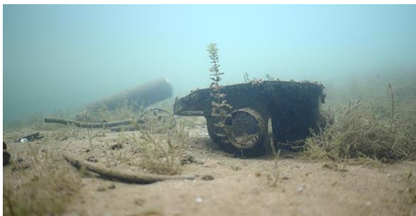
Image 7 Cédric Ernout and Giorgi Gedevanidze, "Die Brücke A559" © Cédric Ernout and Giorgi Gedevanidze